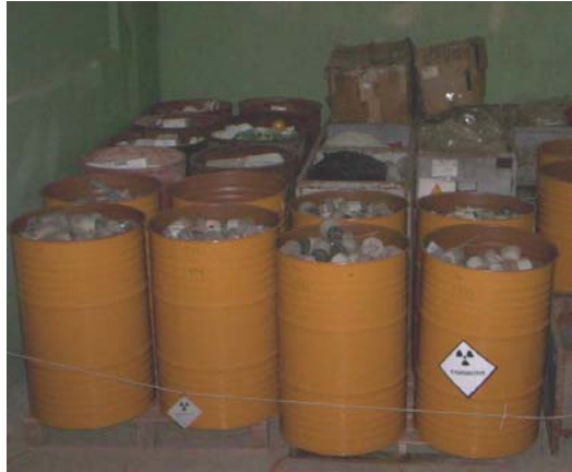
Fig.1. Smoke detectors stored in the waste management facility