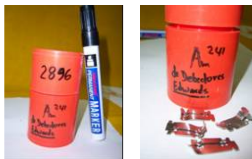
Fig.5. Radioactive sources recovered from smoke detectors awaiting conditioning

Recovered radioactive sources are placed in small containers, depending on the radionuclide and individual source activities (fig. 5). More than 5300 smoke detectors have been dismantled following this methodology.