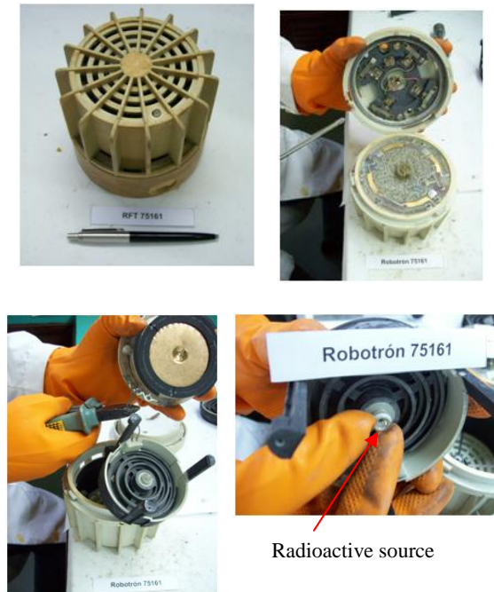
Fig.4. Dismantling smoke detectors (RFT and Robotron) and recovering the radioactive sources

More than 2000 smoke detectors, models Robotron and RFT from Germany, containing Kr-85 radioactive sources are stored in the facility. Specific procedures for dismantling these devices and recovering the radioactive sources were developed and implemented (fig. 4).