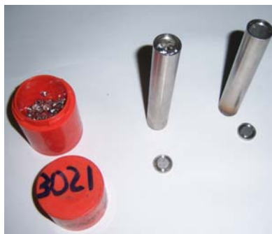
Fig.6. Long lived radioactive sources placed in a capsule for conditioning

The long lived radioactive sources Am-241, Pu-238 and Pu-239 are placed in stainless steel capsules (fig. 6). Sources of the same radionuclide and individual activity are placed in a capsule. The number of sources and the total activity in the capsule is controlled and recorded. As the activity of a source is very low, the amount of sources to be placed in a capsule is limited by the source volume and the capacity of the capsule.